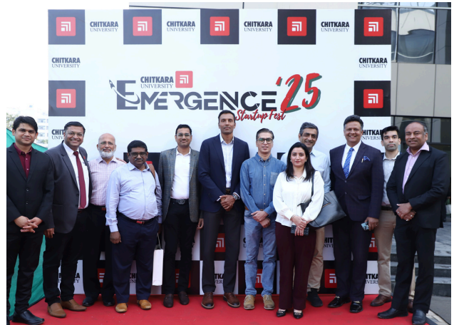
Investors with Chitkara University Team