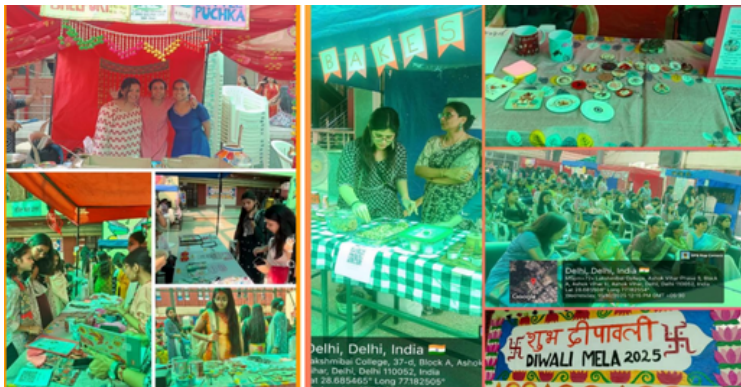
Lakshmibai College, University of Delhi

The Zero Plastic Skill & Entrepreneurship Mela 2025 brought together students, innovators, and young entrepreneurs to promote sustainable living and plastic-free practices. The event showcased eco-friendly products, skill-building activities, and workshops encouraging green entrepreneurship. A successful step toward inspiring youth to adopt and advocate for a zero-plastic future.