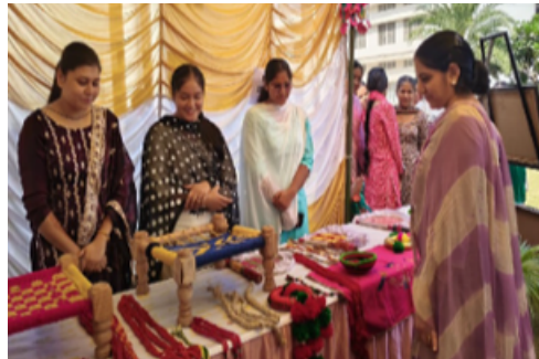
Dev Samaj College of Education for Women, Ferozepur City