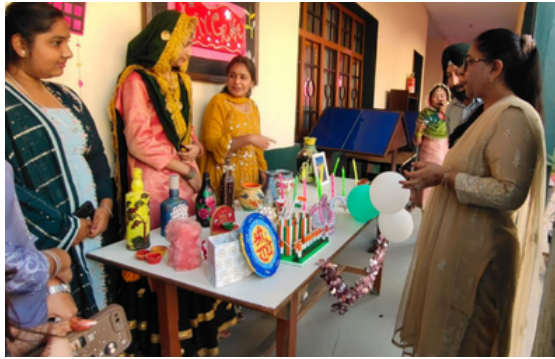
Shivalik College of Education, Gurdaspur, Punjab