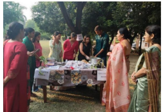
Army Institute of Education, Noida