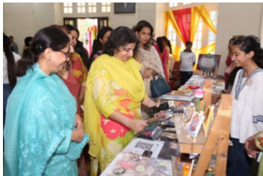
Khalsa College for Women, Civil Lines, Ludhiana