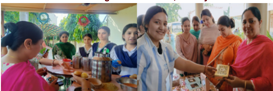
Dasmesh Girls College, Mukerian