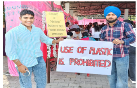
Students of Khalsa College Gardiwalla aware the crowd for no use of plastic