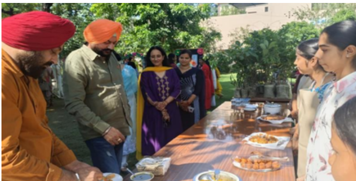
G.T.B Khalsa College For Women, Dasuya