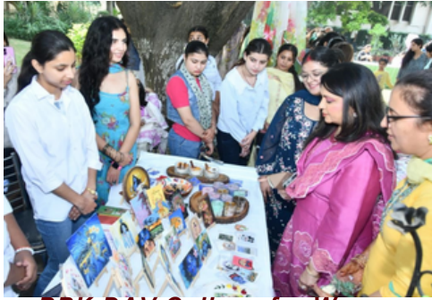
BBK DAV College for Women, Amritsar, Punjab