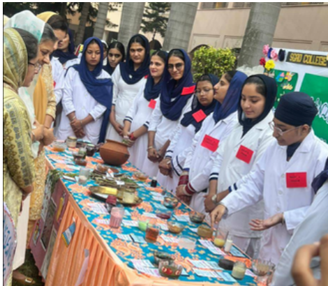
Sri Guru Angad Dev College of Education, Khadur Sahib