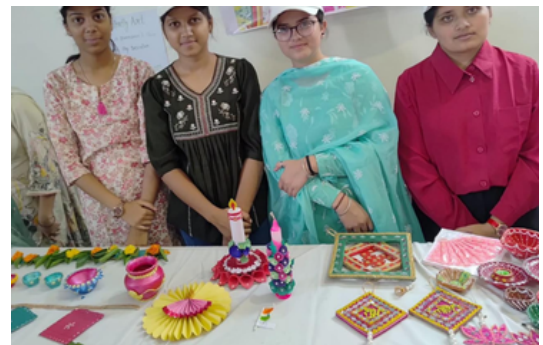
Shri Sanatan Dharam Girls' College, Bathinda