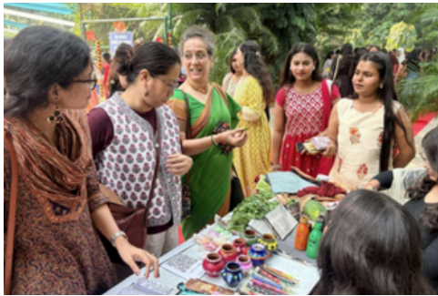
Janki Devi Memorial College, University of Delhi