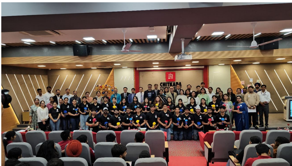
New Ecolution Club's Core Team