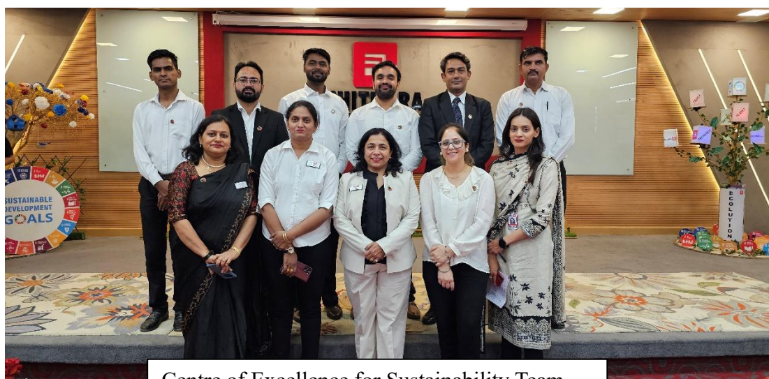
Centre of Excellence for Sustainability Team

With every upcycled project, every awareness campaign, and every conversation sparked, the Ecolution Club continues to light the path for a more sustainable and conscious tomorrow—reminding us all that real change begins with us.