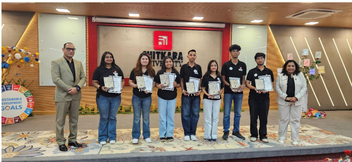
Old Ecolution Club's Core Team