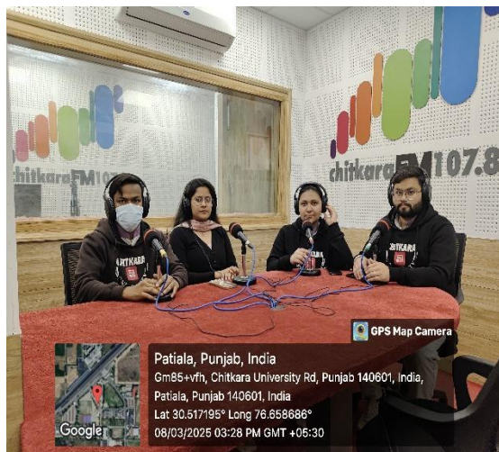
Radio talk on International Women's Day talking about introduction of International Women's Day on 8 th March, 2025.