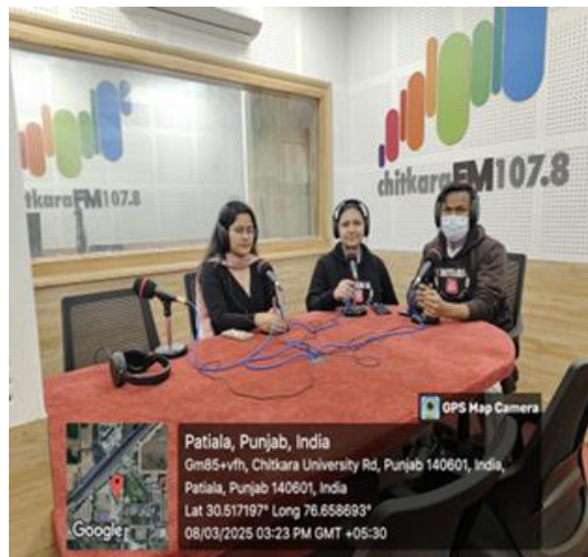
Radio talk on International Women's Day talking about theme of International Women's Day on 8 th March, 2025.