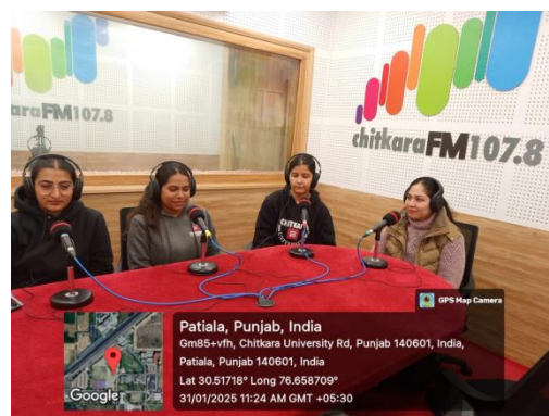
Student telling about Challenges to dated 24 th