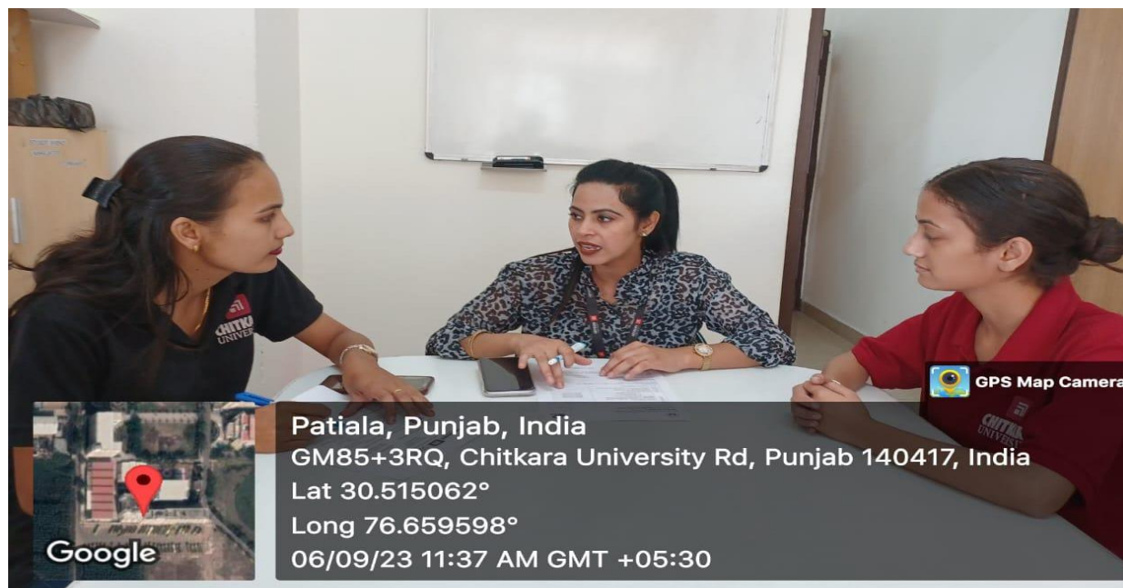
Radio Talk on Postnatal Diet on 6 th Sep, 2023