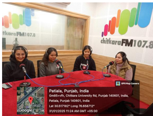
Radio talk on Nation Girl Child Day Accessing Education for girls dated 24 th Jan, 2025 Jan, 2025

By making these small but impactful changes, we can all contribute to a cleaner, healthier environment.