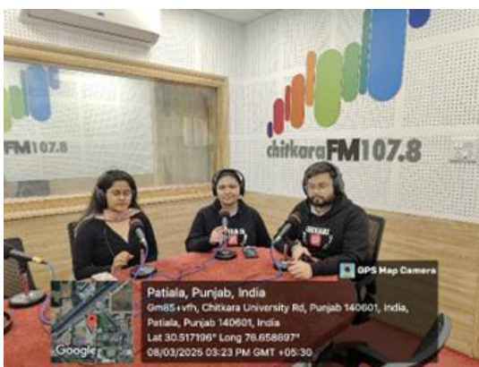
Radio talk on International Women's Day talking about Significance of Celebrating International Women's Day on 8 th March, 2025.