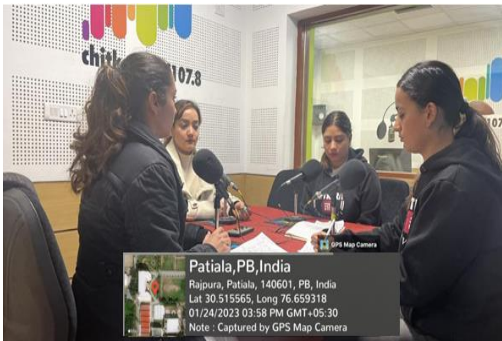
Radio talk: National Girl Child Day; 24, January, 2023