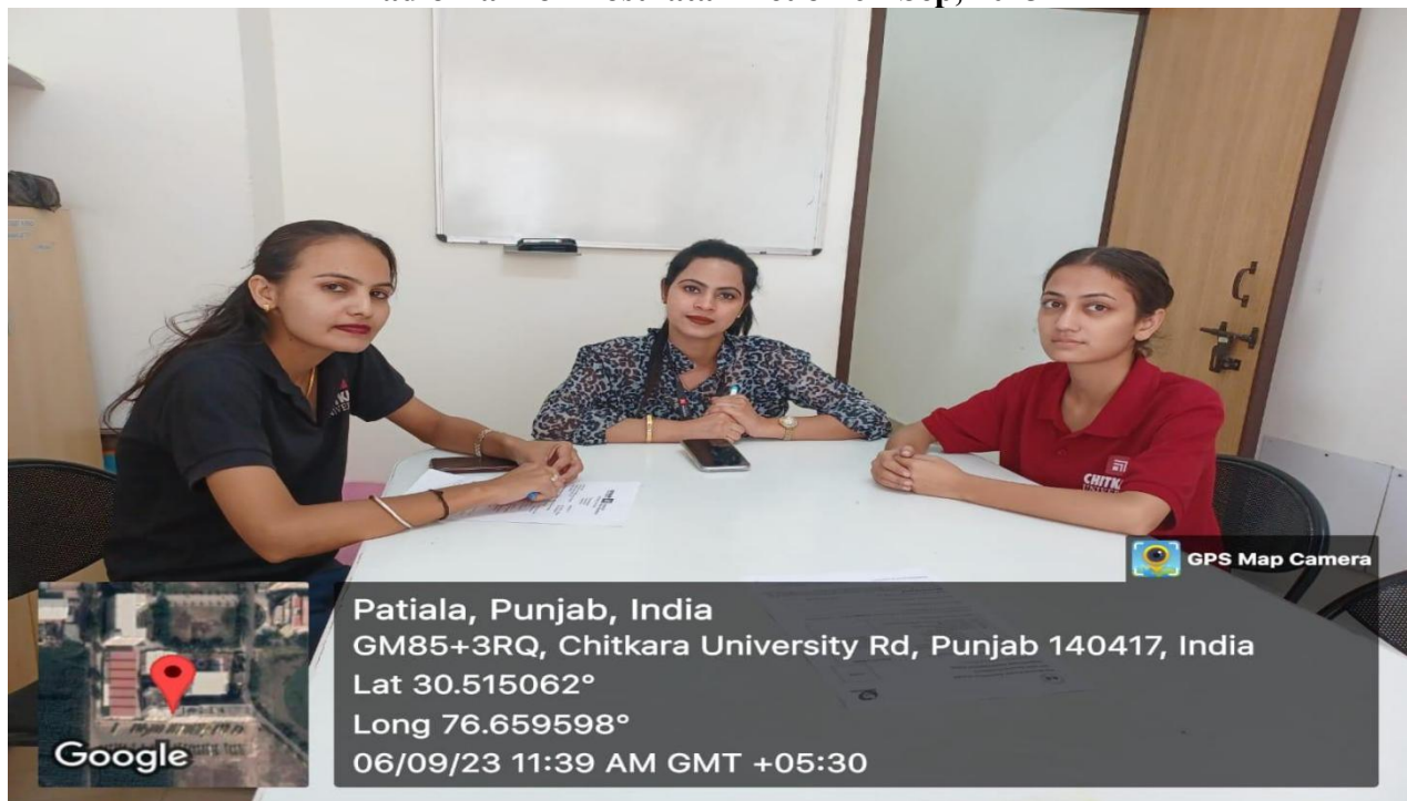
Radio Talk on Postnatal Diet on 6 th Sep, 2023