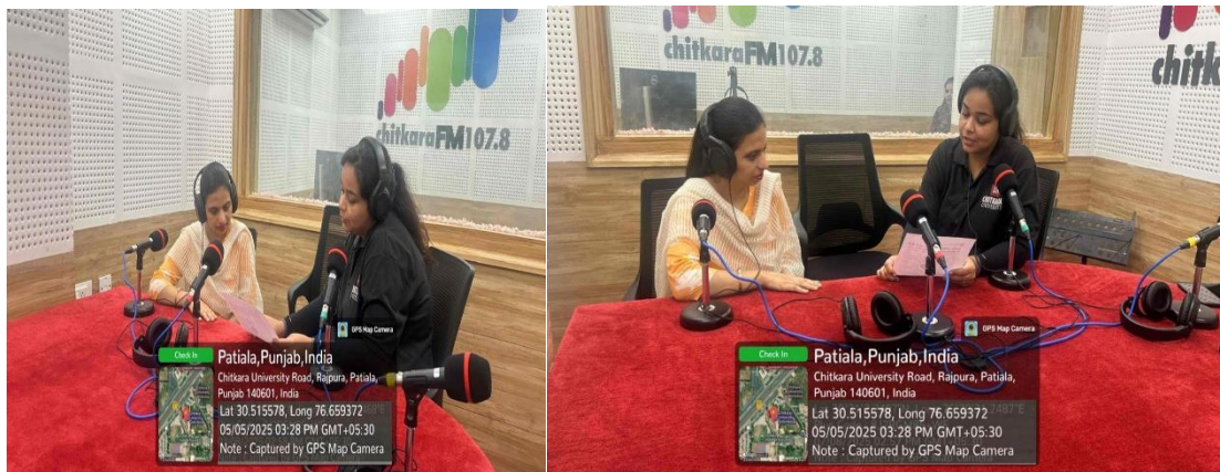
Students giving Radio talk on role of family and community on safe birth dated 5 th May, 2025