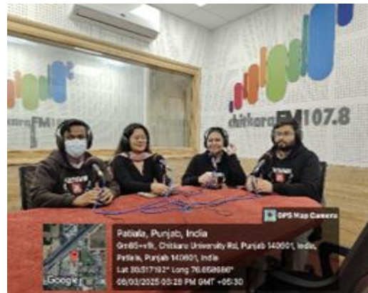
Radio talk on International Women's Day talking about Challenges Faced by Women on International Women's Day on 8 th March, 2025.