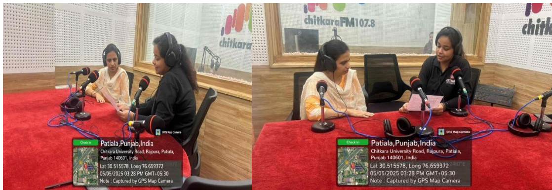
Students giving Radio talk on Clean and safe delivery practices for safe birth dated 5 th May, 2025