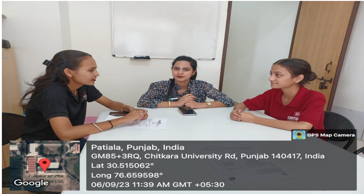
Radio Talk on Postnatal Diet on 6 th Sep, 2023