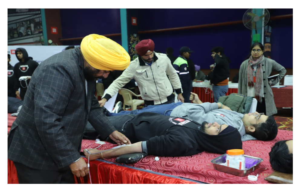
Students supporting the noble cause at Blood Donation Camp