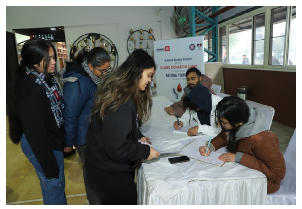
Students activation in Blood Donation Camp