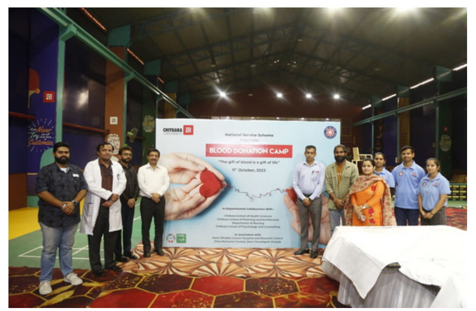
A successful blood donation camp in collaboration with Homi Bhabha Cancer Hospital and Research Centre