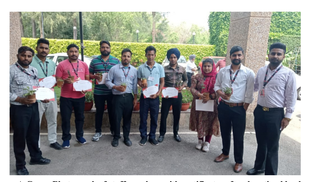
A Group Photograph of staff members with certificates after donating blood