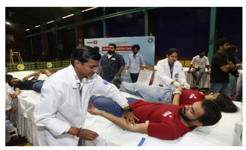
Young selfless hearts come forward for an honourable purpose