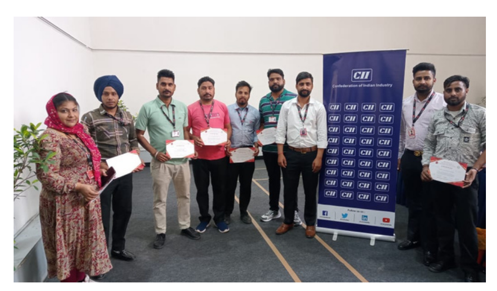
Office of Administration staff members at CII centre for blood donation