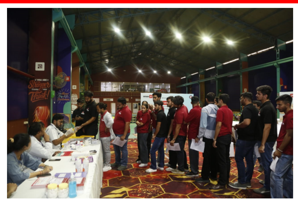
Students lining up to register themselves for blood donation