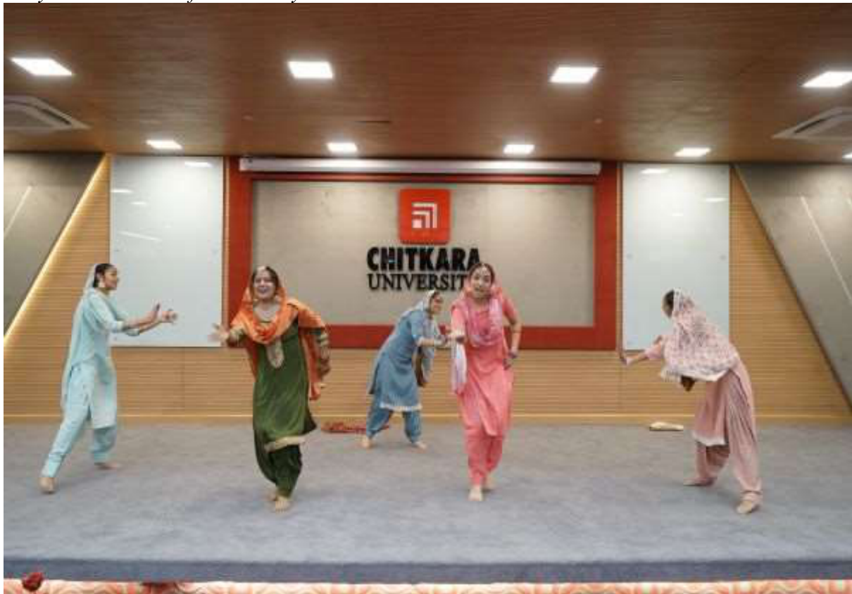
Students representing Punjab through Gidha