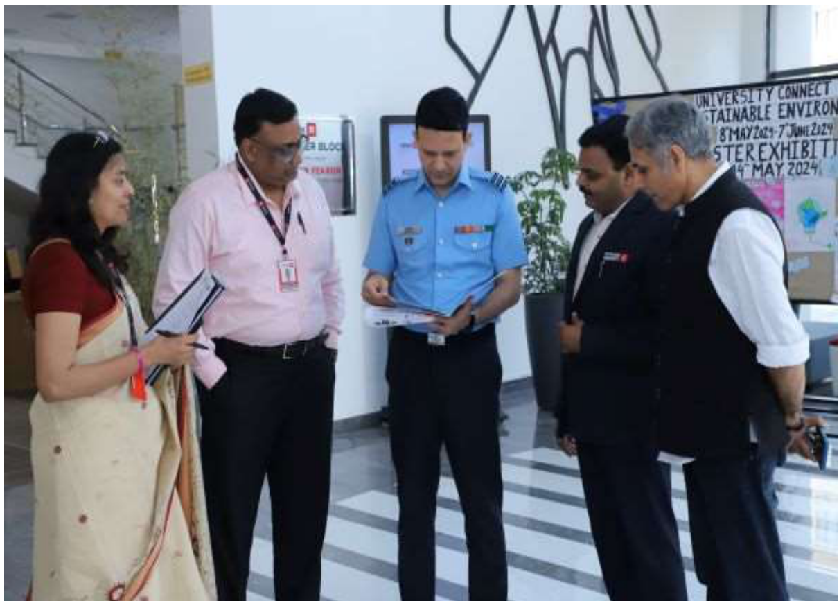
Poster Making Competition Results compilation by the Judges.