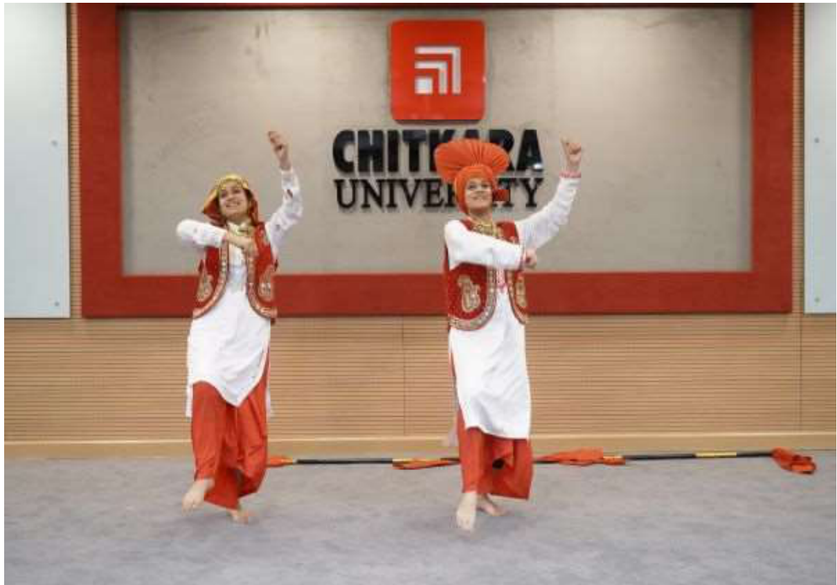
Bhangra performance by the students.