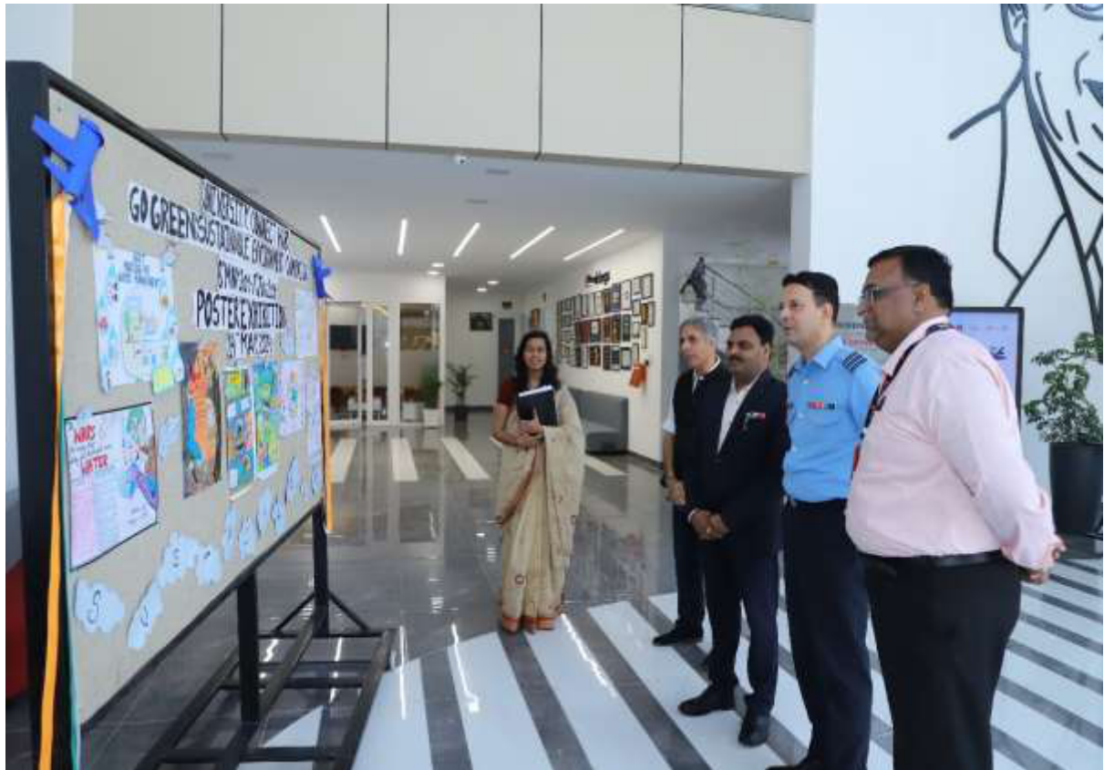
Judges visiting the exhibition on 14 th May, 2024.