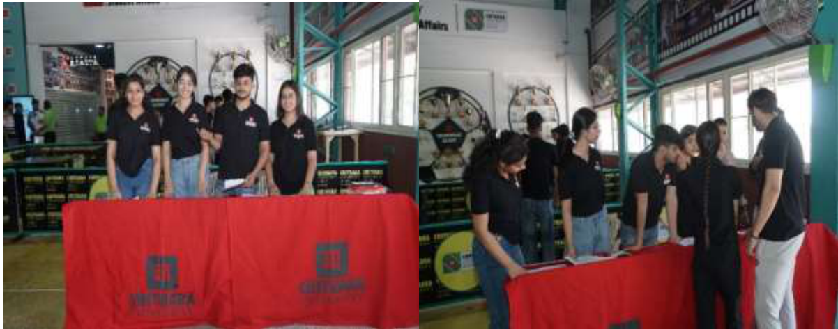
Students doing registrations at Registration Counter