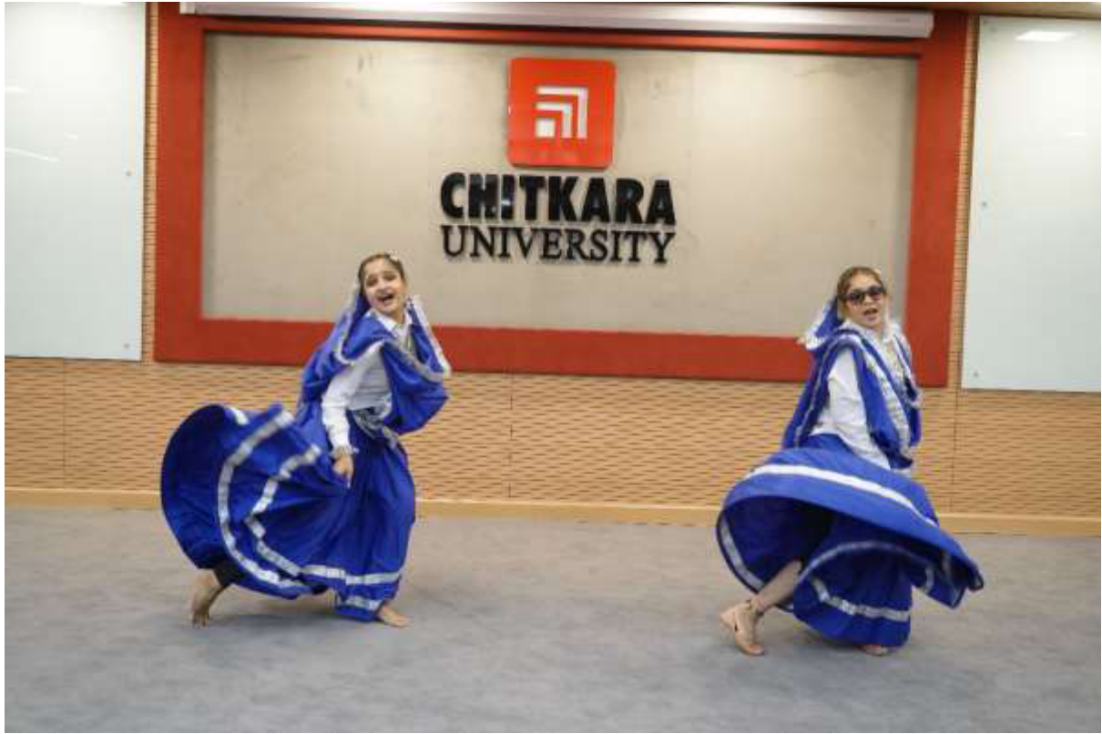
Haryanvi Dance Performance by the students