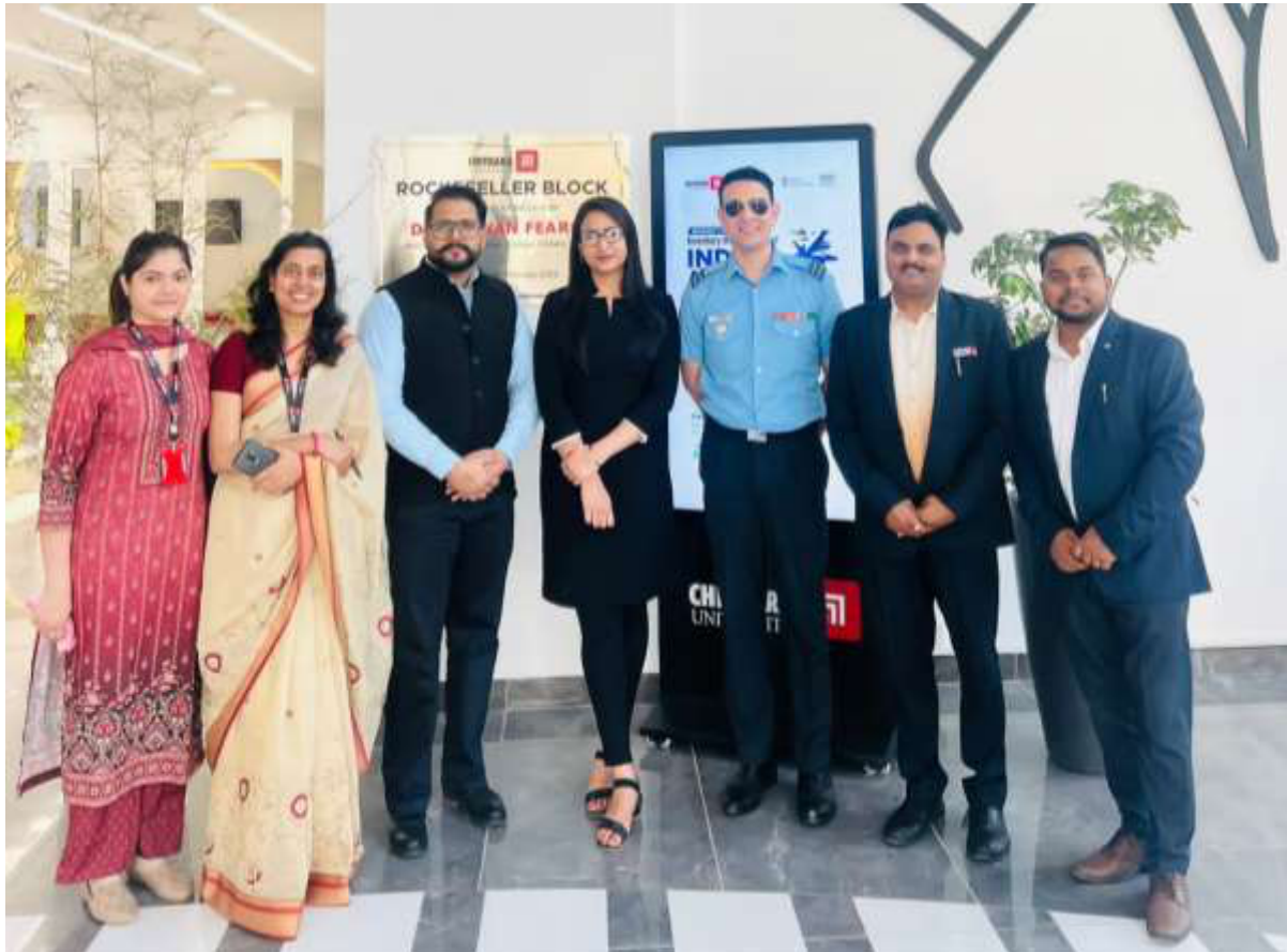
Faculty of Economics welcoming eminent speaker of the event.