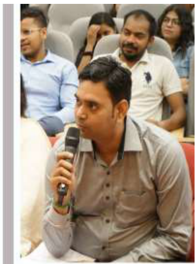
Judges Questioning Round