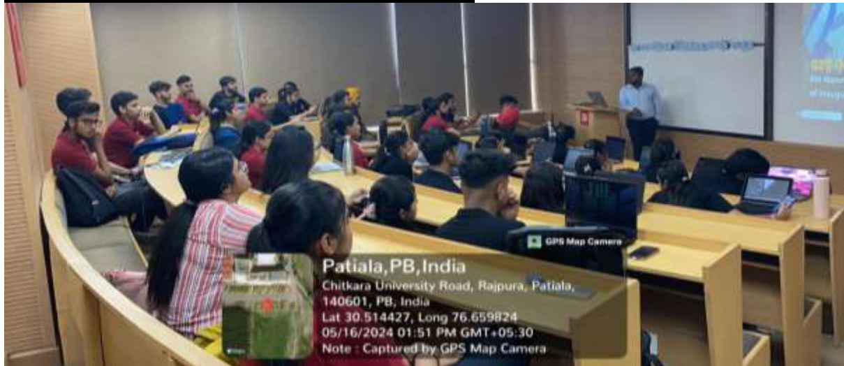
Students watching Video Theme G-20