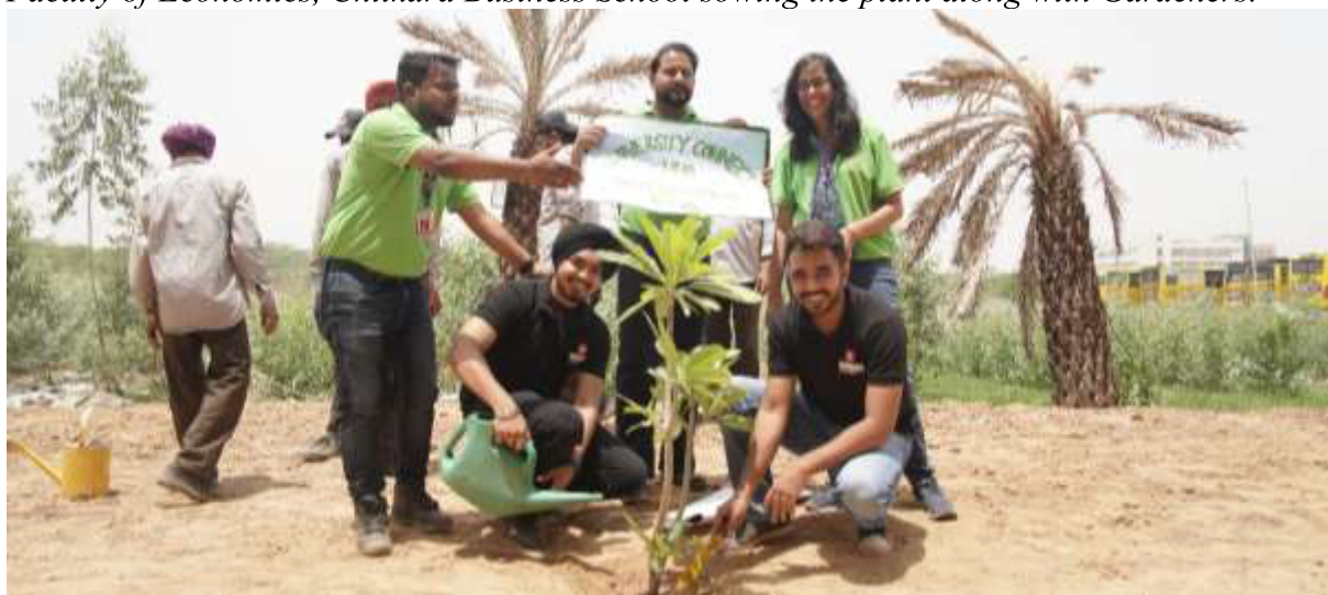
Students sowing plants on 5 th June, 2024.