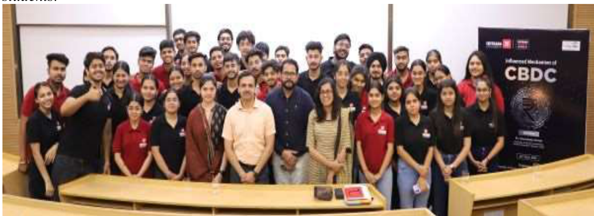
Group Photograph at the culmination of the event.