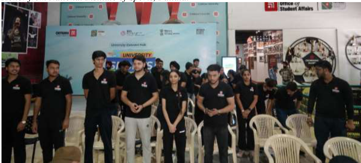
Students welcoming Judges, Eminent guests, Deans', Directors and Program Heads from National Institute of Sports, Patiala and Chitkara University Campus.