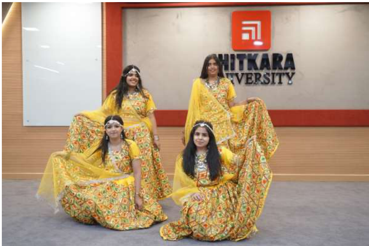
Gujarati Folk Dance Performance