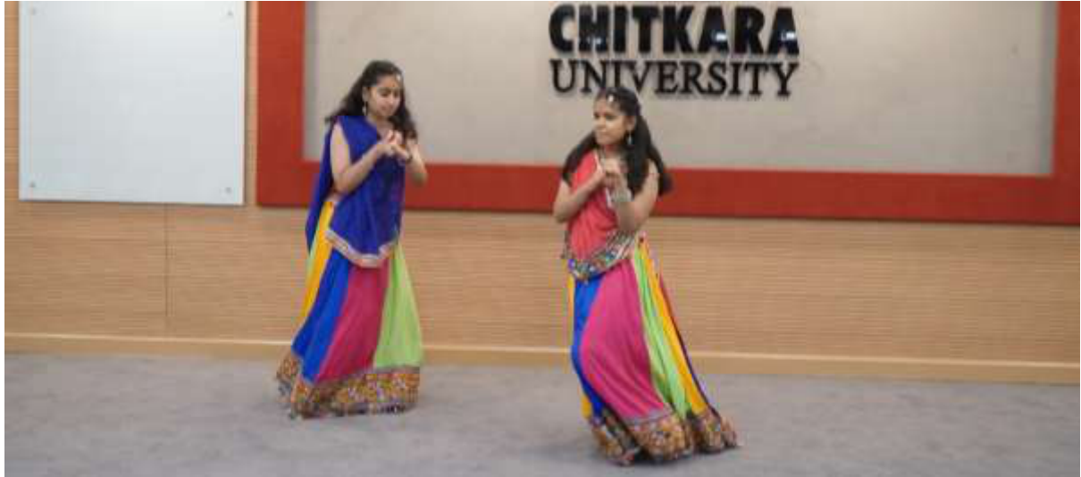
Students representing Rajasthan through their Folk Dance