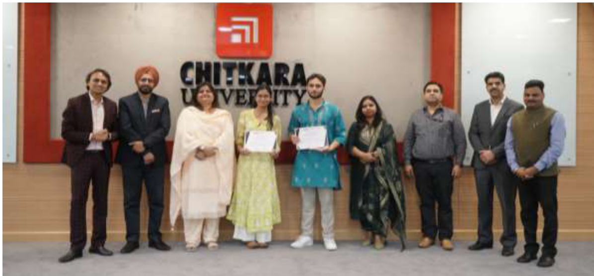
Moderator students of the event were encouraged with appreciation certificates.