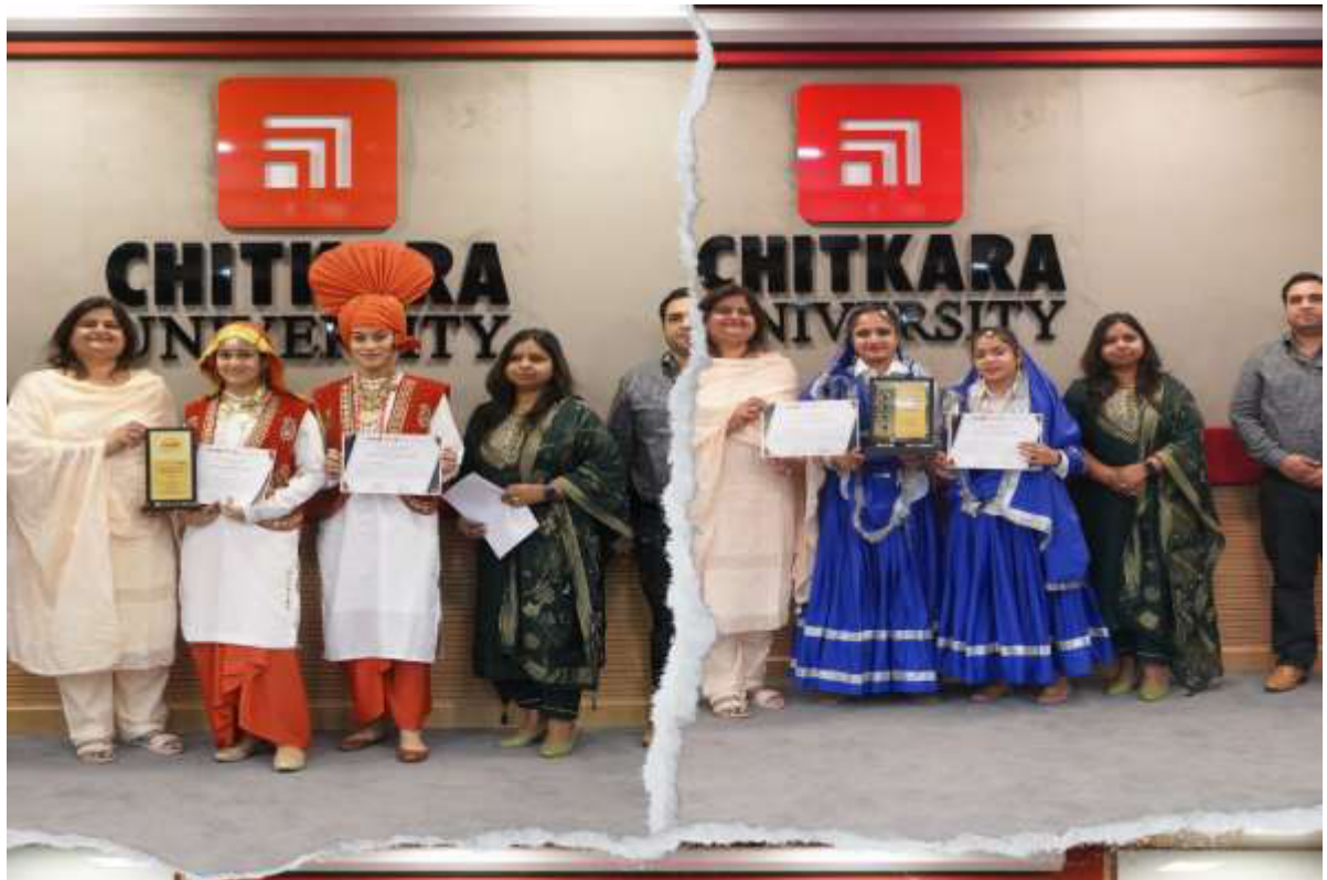
1 st , 2 nd and 3 rd position holders in Folk Dance Performances