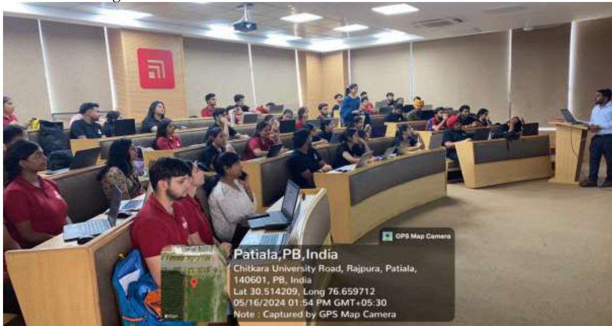
Students attempting Online Quiz.