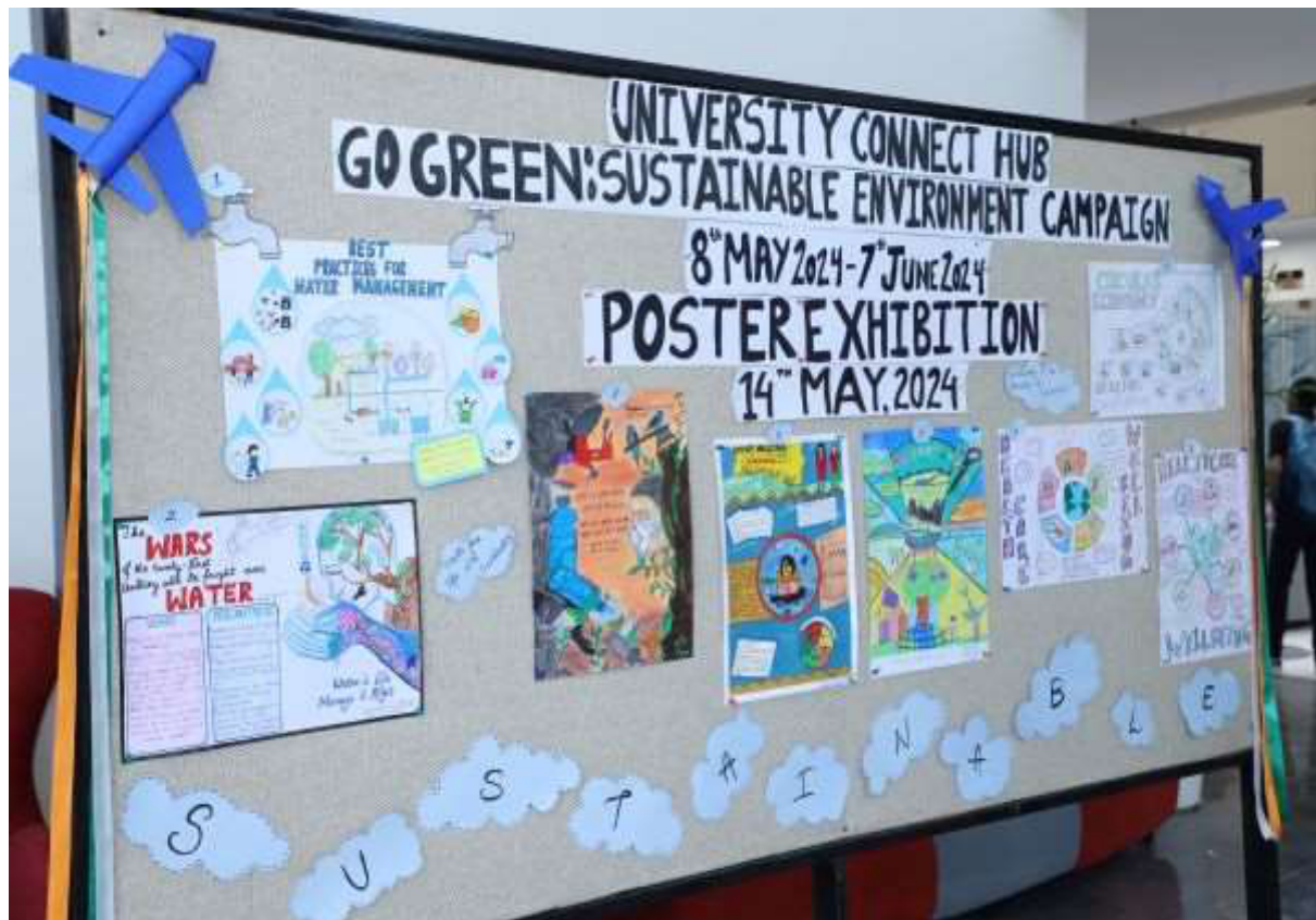
Poster Exhibition at Rockefeller Building, Chitkara Business School.