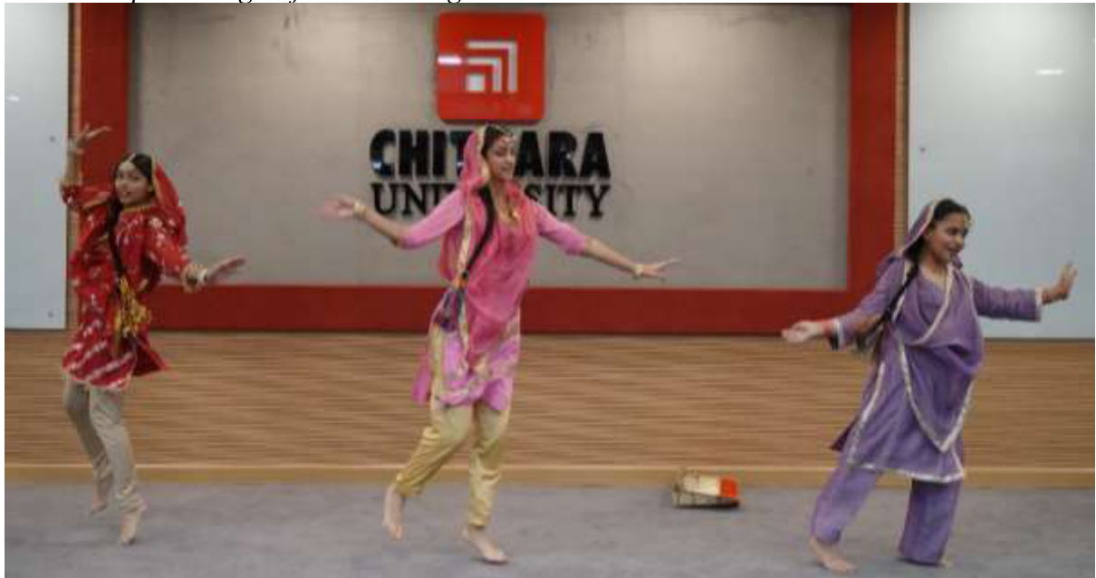
Students representing Kashmir through Dogri Dance Form.