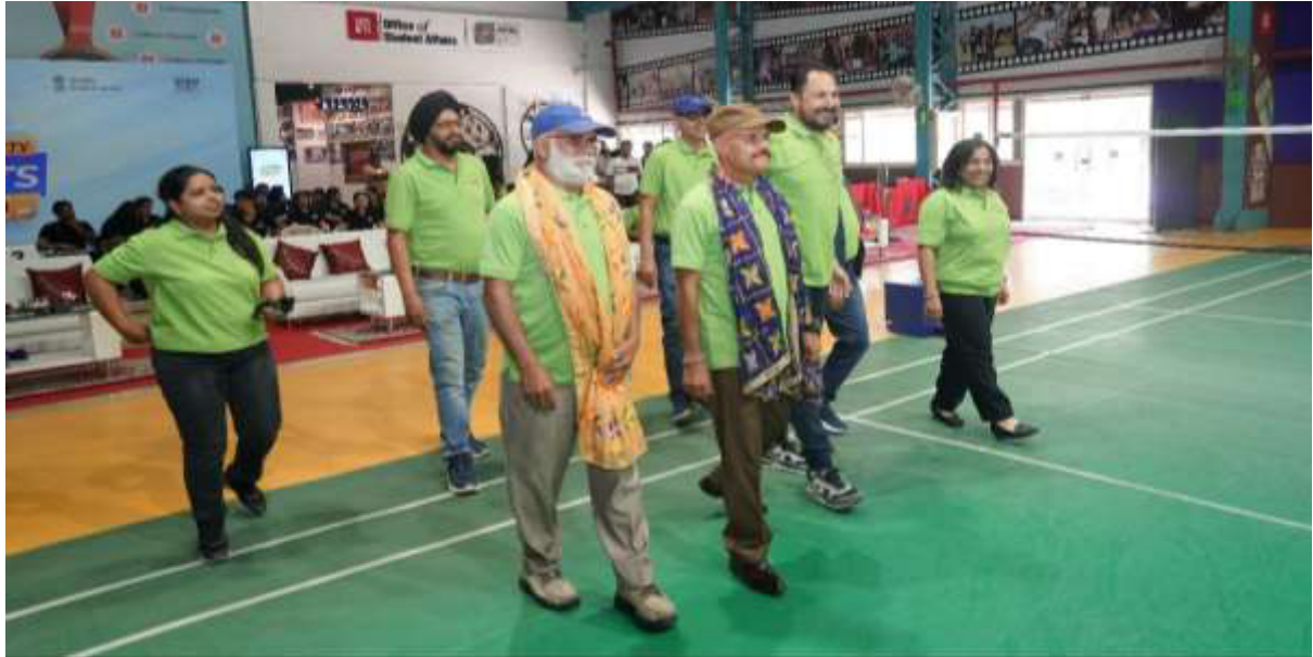
Guests moving on the Badminton Court for formal opening of the event.