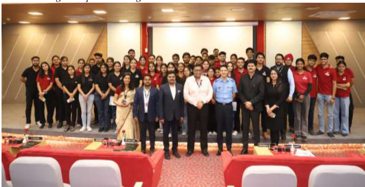
Group Photograph on the culmination of the event.