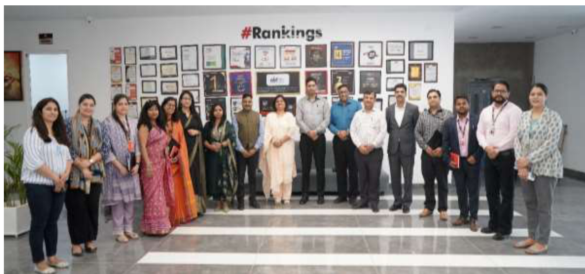
Team Faculty of Economics welcoming Judges, Guests of Honor and Eminent Guests.