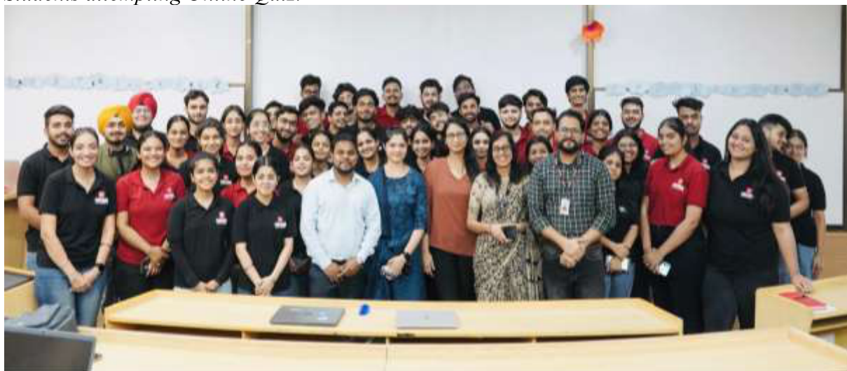
Group Photograph at the culmination of the event.