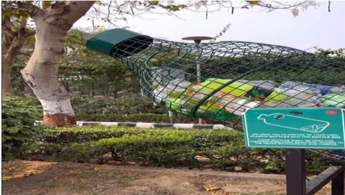
Digital Reel by Amrender focusing on Sustainable Practices.