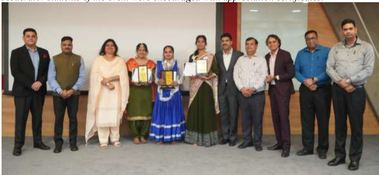
1 st , 2 nd and 3 rd position holders in Cultural Representation