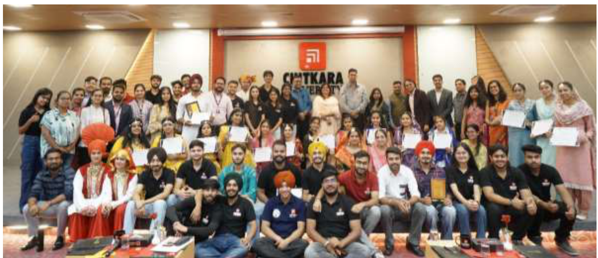
Group Photograph on the culmination of the event.