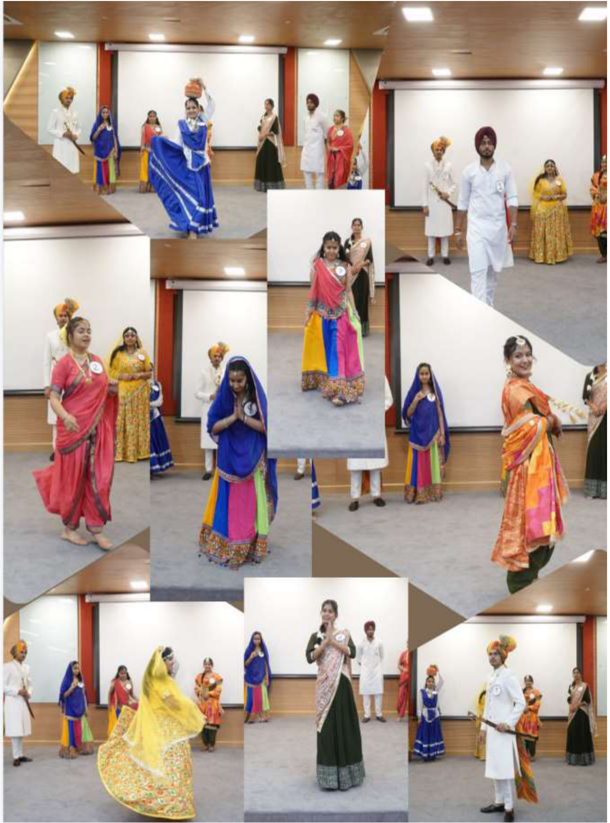
Students Representing the Culture of various States like Haryana, Punjab, Maharashtra, Rajasthan, Gujarat and Chennai etc through their attires.