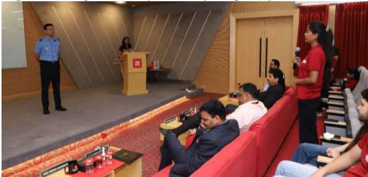
Student solving their queries during Interactive session.