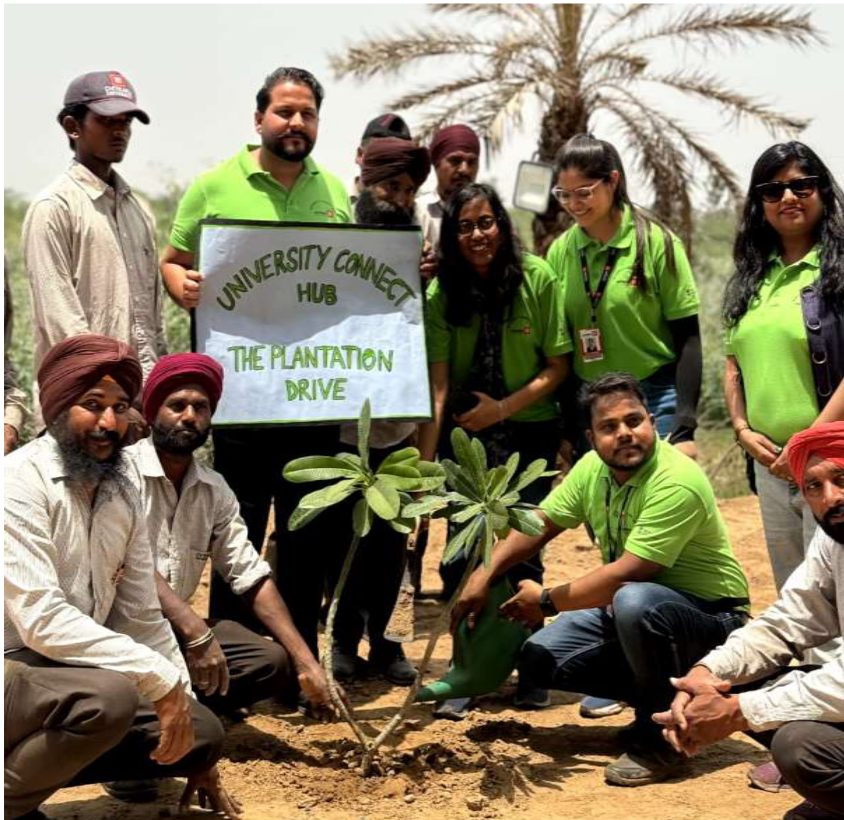
Faculty of Economics, Chitkara Business School sowing the plant along with Gardeners.