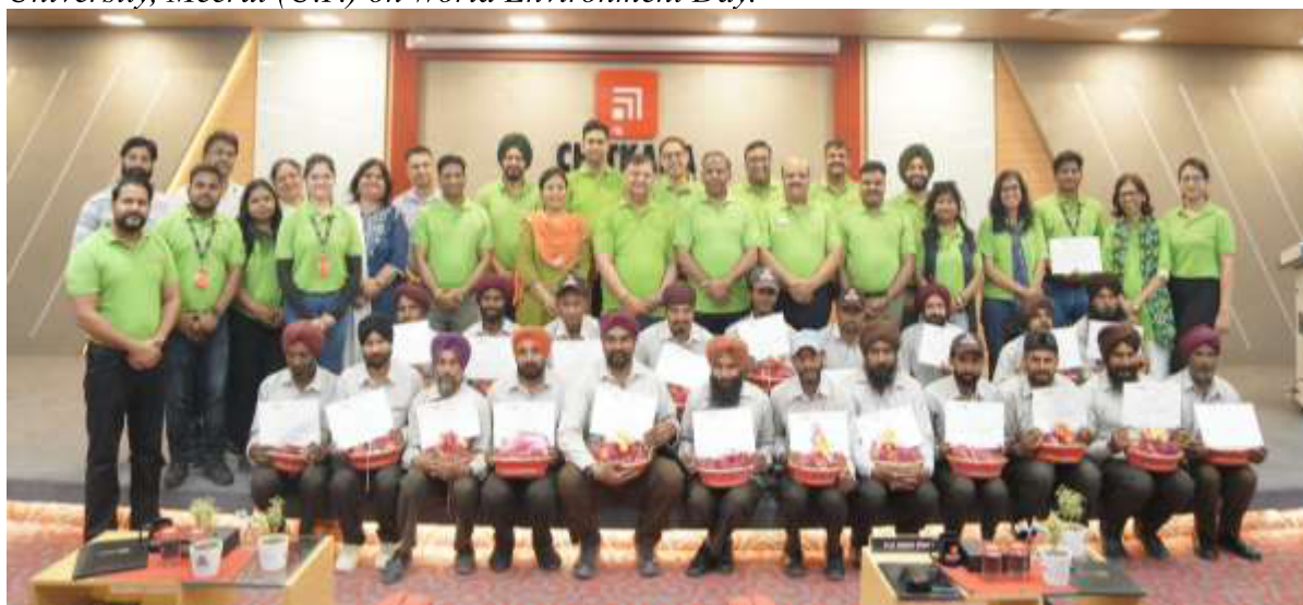
Gardeners of Chitkara University were awarded with “Certificate of Honor” and Token of Appreciation”.