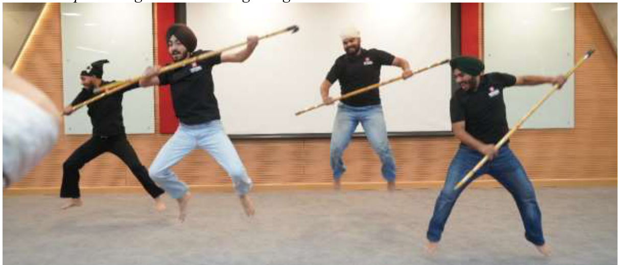
Enthusiastic Students filler performance.