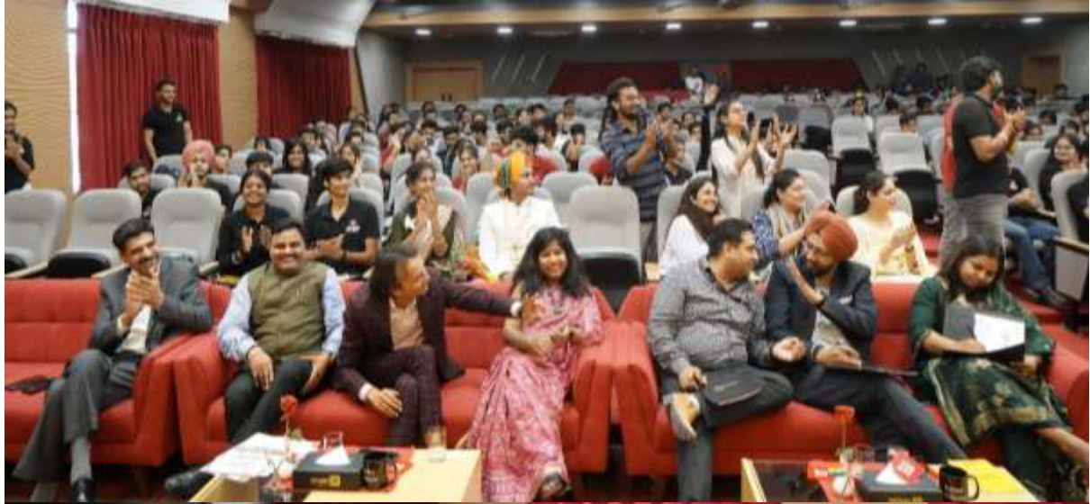
Audiences enjoying the performances by the participants.