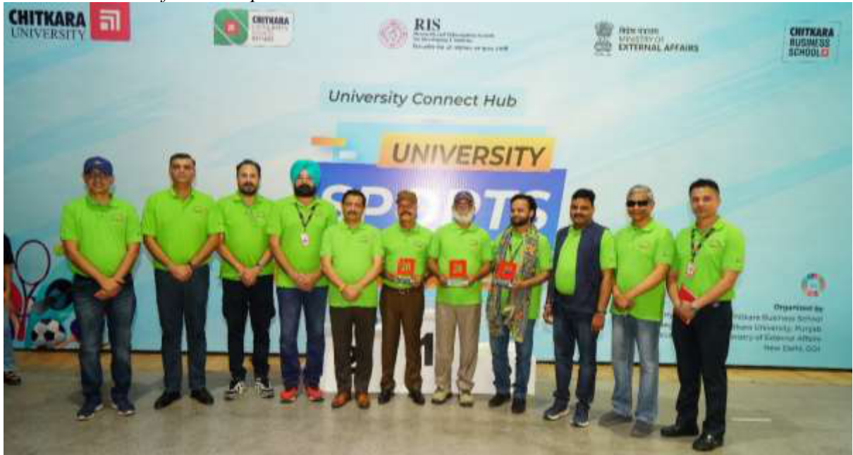
Felicitation of Chief Guest and Guests of Honor.