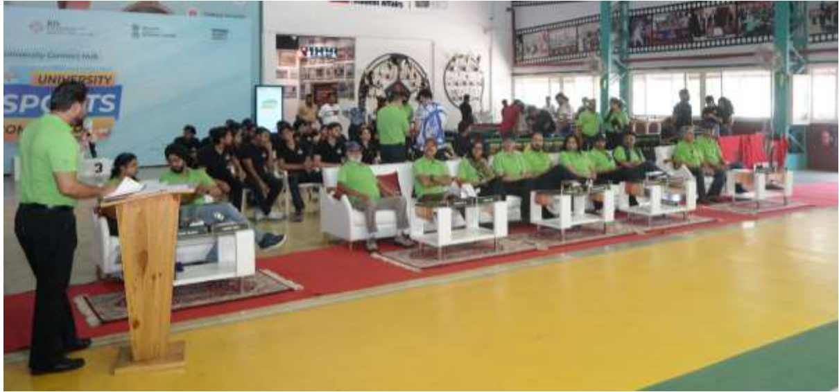
Commencement of the Competitions.