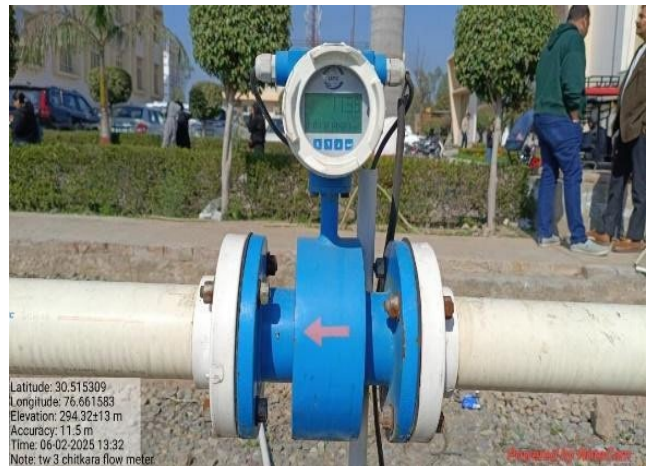
Photographs of Tubewells along with Flowmeters at University Campus