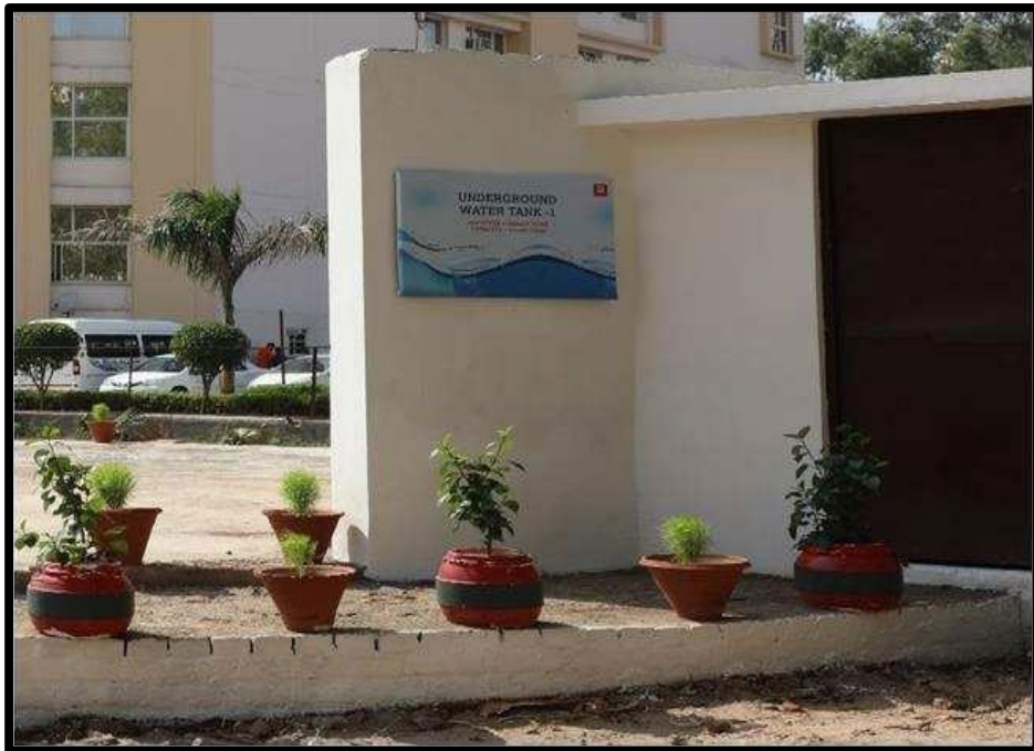
Underground storage tank of 400 KL