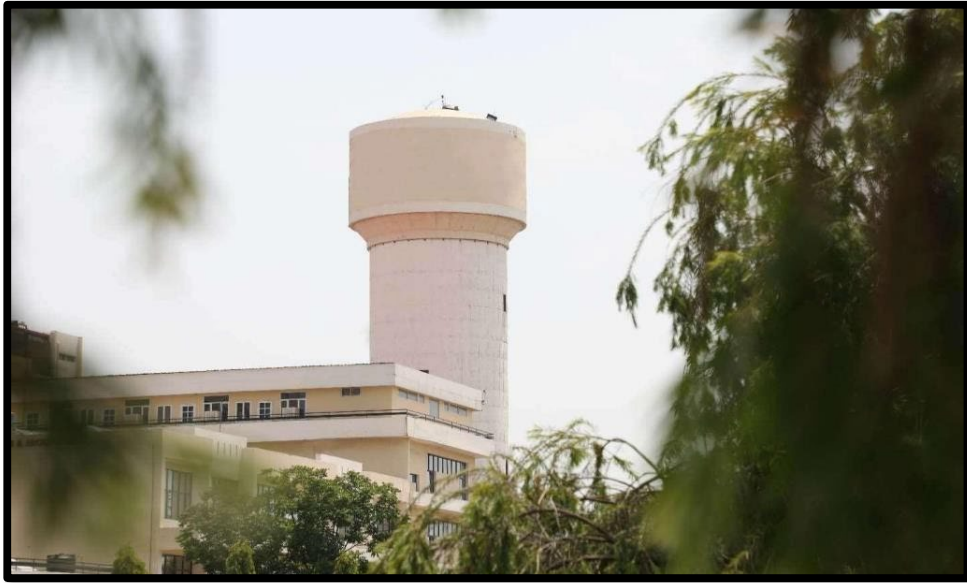
Overhead Tank of Capacity 400KL