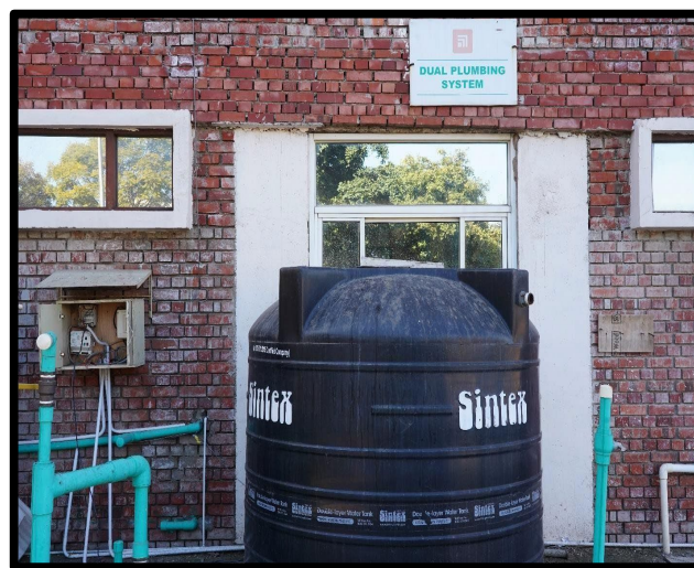
Dual plumbing system at Chitkara University, Punjab

Dual Plumbing: Treated water is utilized for horticulture and double plumbing systems in several buildings. This practice helps in reducing the consumption of freshwater, and the treated water is further processed in the Sewage Treatment Plants (STPs) during its use.