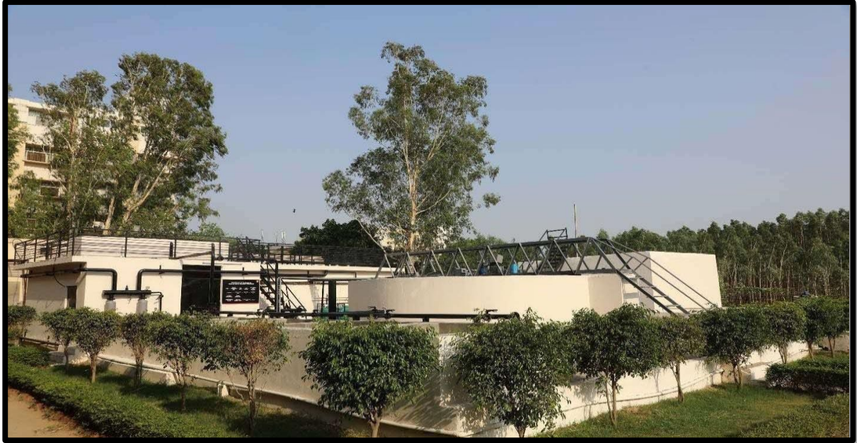
Treated wastewater being used in the campus and Sewage Treatment Plant of capacity 1 MLD