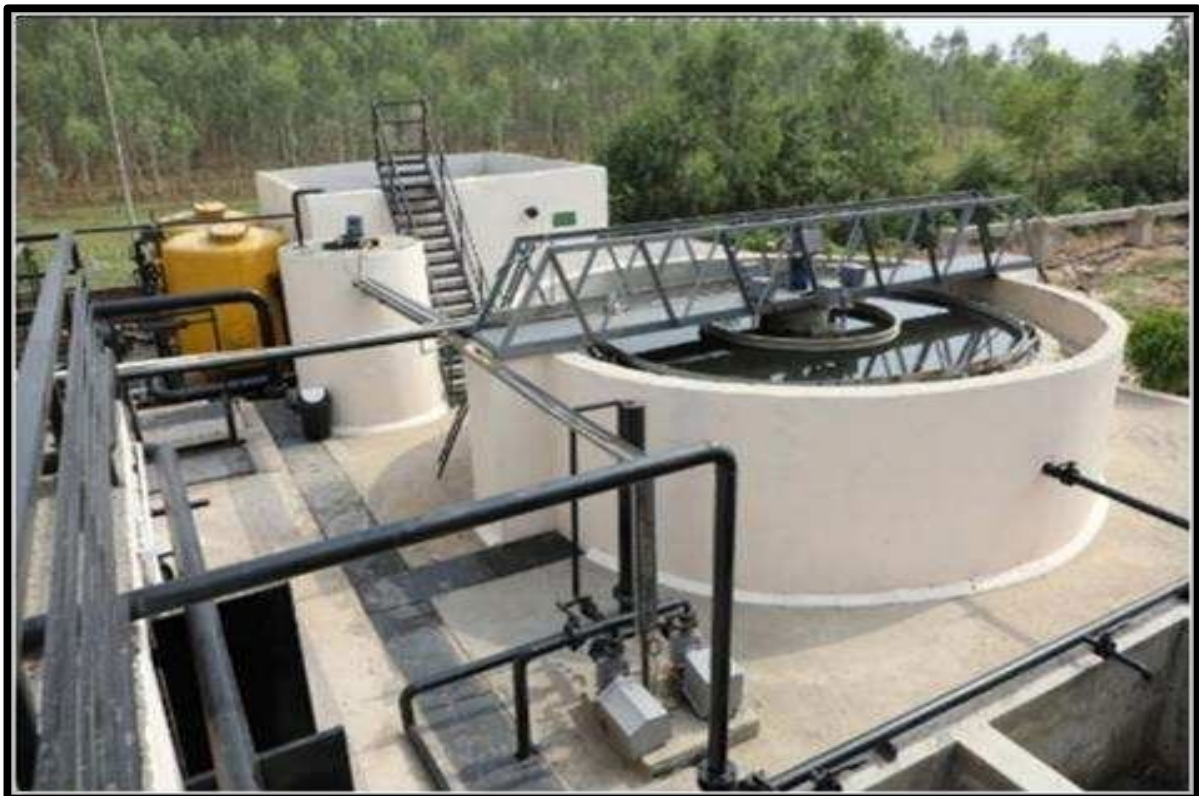
Treated wastewater being used in the campus and Sewage Treatment Plant of capacity 1 MLD