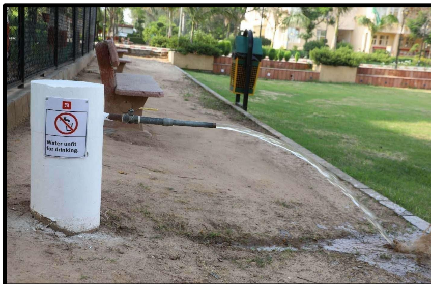
Treated water being used in horticulture

Efficient Water Fixtures: Other methods adopted to minimize water wastage include the installation of aerators on all taps to reduce flow without compromising usability, the use of low-