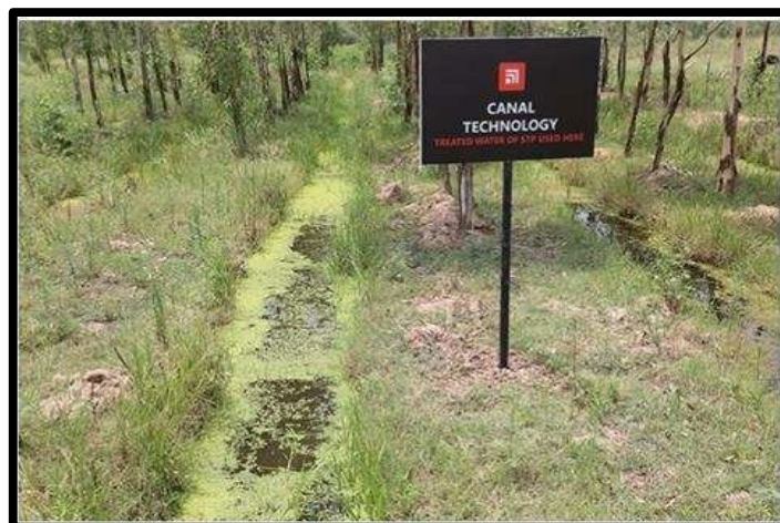
Karnal technology in which treated STP water is used

Karnal Technology: With Karnal Technology, trees are planted on ridges that are one meter board and fifty centimeters high, and treated wastewater is disposed of in furrows. The age, kind of plants, soil texture, climate, and effluent quality all affect how much waste needs to be disposed of. The whole effluent flow is controlled such that no standing water remains in the trenches after 12 to 18 hours of consumption. This method allows for the daily disposal of 0.3 to 1.0 ML of wastewater per acre.