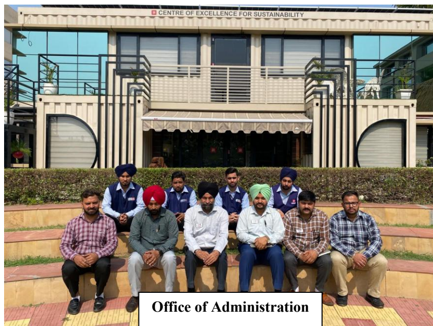
Office of Administration