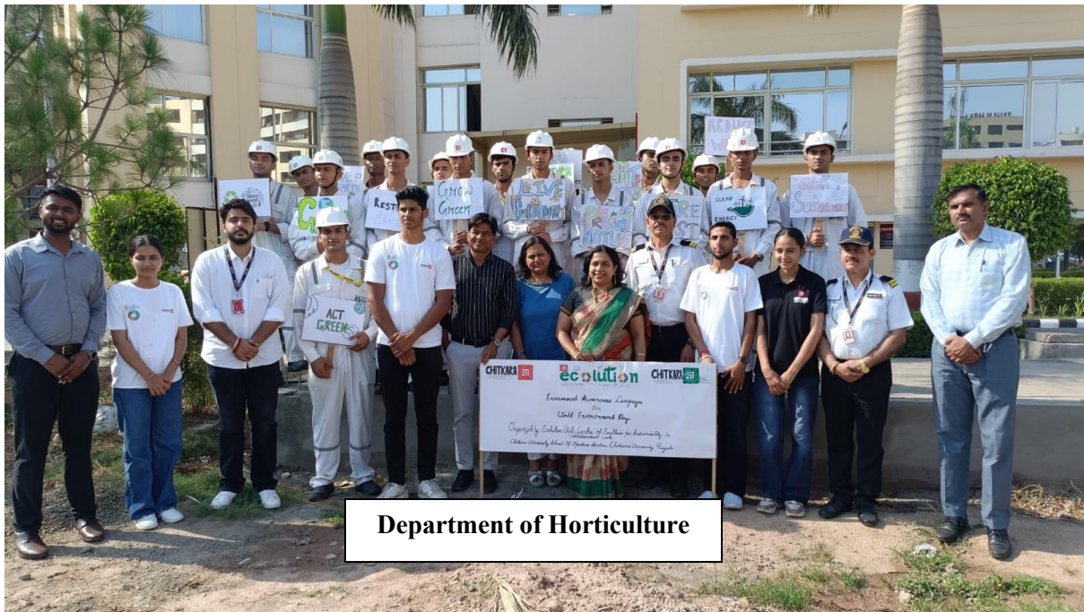
Department of Horticulture